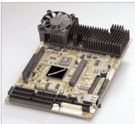
The EBC-855-G-1.8-1 and EBC-855-1G-1 units include fan and heatsink.

The 1GHz ZC Dothan is Intel's 90-nanometer (nm) process from its Celeron family of CPUs. It draws very low power (only 5.5W max.) which allows it to operate from -40°C to +70°C without the need for a fan or the necessity to slow down the CPU clock frequency. However, if a fan is added, then the upper limit of the operational temperature range is extended to +85°C operating at 1GHz.