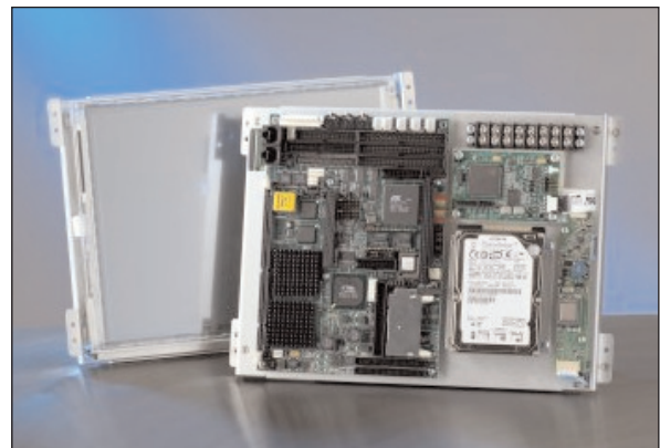
WinSystems' Flat Panel Embedded PC

Video Interface - The CRT video output signals are wired to a 14-pin dual-in-line connector at the edge of the board. An optional CBL-234-1 interface cable adapts it to a standard female 15-pin "D-Sub" type connector commonly used for VGA. Simultaneous operation of the CRT and LCD is supported with two different video images can be displayed as well. This feature is equivalent to a second video controller card onboard.